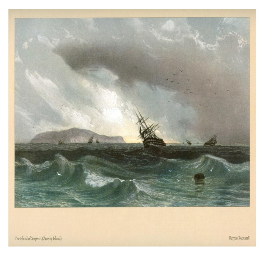
FIG. 3. The White Island (in old-Greek Leucos ; in Latin Alba ) is the mystical island where the Achilles' tomb is probably located. Nowadays, however it is called Snake island (in Ukrainian Ostriv Zmiinyi ; in Romanian Insula Serpilor ). The island is located in the Black sea but very near to the Danube Delta. A picture by the Italian painter Carlo Bossoli, 1896.