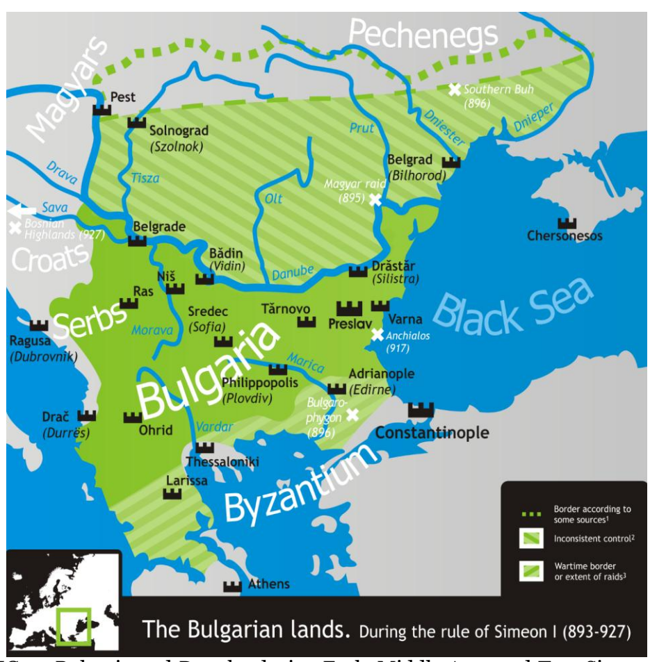
FIG. 5. Bulgaria and Danube during Early Middle Ages and Tsar Simeon I rule (893-927).

The presence of many fortified Bulgarian and Serbian cities indicate that it was difficult to penetrate the lands south of Danube in the early Middle Ages as well.