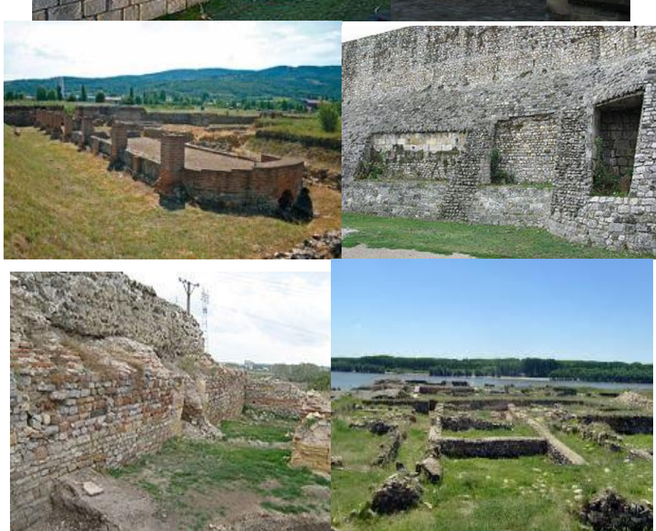
FIG. 4 Some ancient fortification systems along lower Danube nowadays, from left to the right:

Upper line: Durostorum (Silistra) and Babonia (Vidin) - Bulgaria